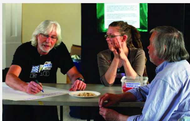
working on ideas to combat prejudice