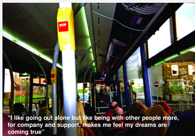
taken from a recent photography based social inclusion project for people in NHS residential services