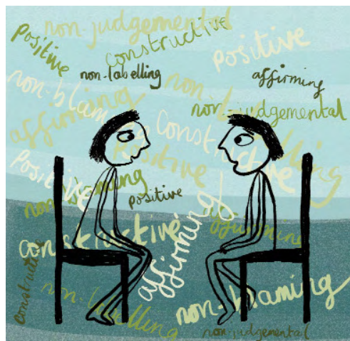
taken from recent peer support worker training